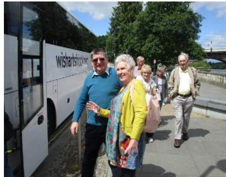
Where to next?