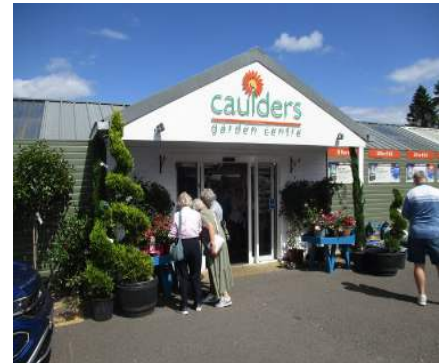
Caulders in Cupar