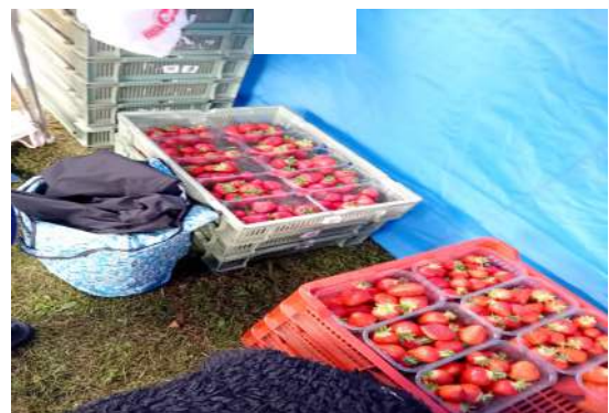
Strawberries sold well - all gone