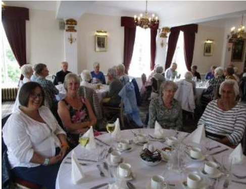
Lunch in Perth