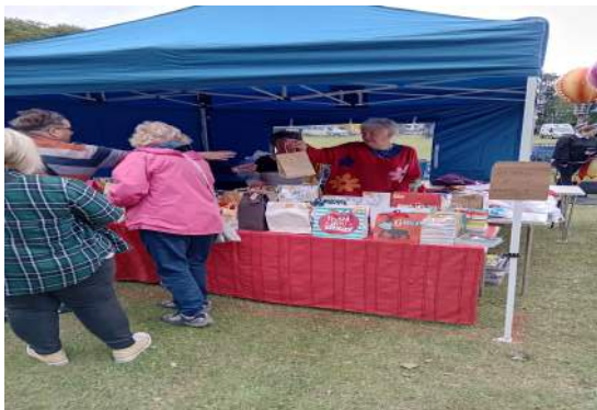
Carnoustie Trinity Stall