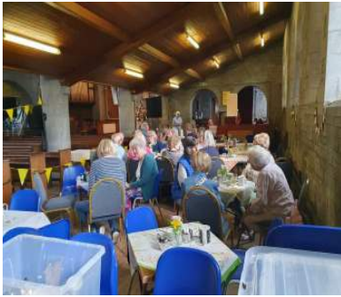
LUNCH IN PERTH