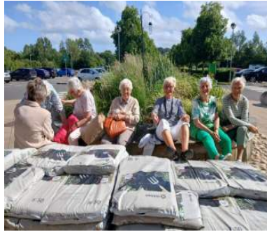
WEATHER TOO GOOD FOR RETAIL THERAPY