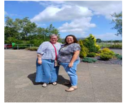
BETTER TO ENJOY THE SCENERY